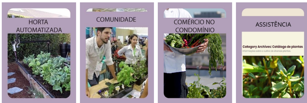
[Figure 4] Cards from the fourth group (lilac), translated (left to right): Automated garden; Community; Trade in Apartment complex; Assistance (Font: The Authors, 2019).

A final group with 4 cards in lilac color (Figure 4), aimed to obtain information about the reaction of the possible user to the proposal of the service, with information related to an automated garden, information shared among the members, commerce in the condominium (sale or exchange of organic products produced on site) and assistance provided by the company to the client.