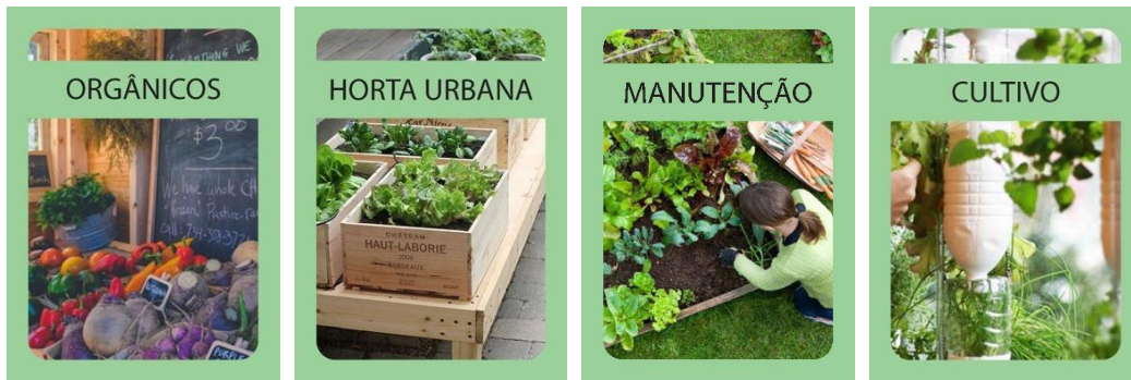
[Figure 3] Cards from the third group (green), translated (left to right): Information Source; Plants; Flower shop; Residents, Agrotoxic; Organics; Urban Garden; Maintenance; Farming.

A final group with 4 cards in lilac color (Figure 4), aimed to obtain information about the reaction of the possible user to the proposal of the service, with information related to an automated garden, information shared among the members, commerce in the condominium (sale or exchange of organic products produced on site) and assistance provided by the company to the client.