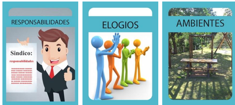
[Figure 1] Cards from the first group (blue), translated (left to right): Responsibilities; Compliments; Ambience.

We created four categories of cards with the colors: blue, yellow, green and lilac. The group of blue letters, out of a total of three (Figure 1) sought to understand the role of the respondent in her role as a syndic of a condominium. Therefore, the cards sought to gather information about their responsibilities, how to deal with compliments/complaints, and about the condominium environment, especially green and shared areas.