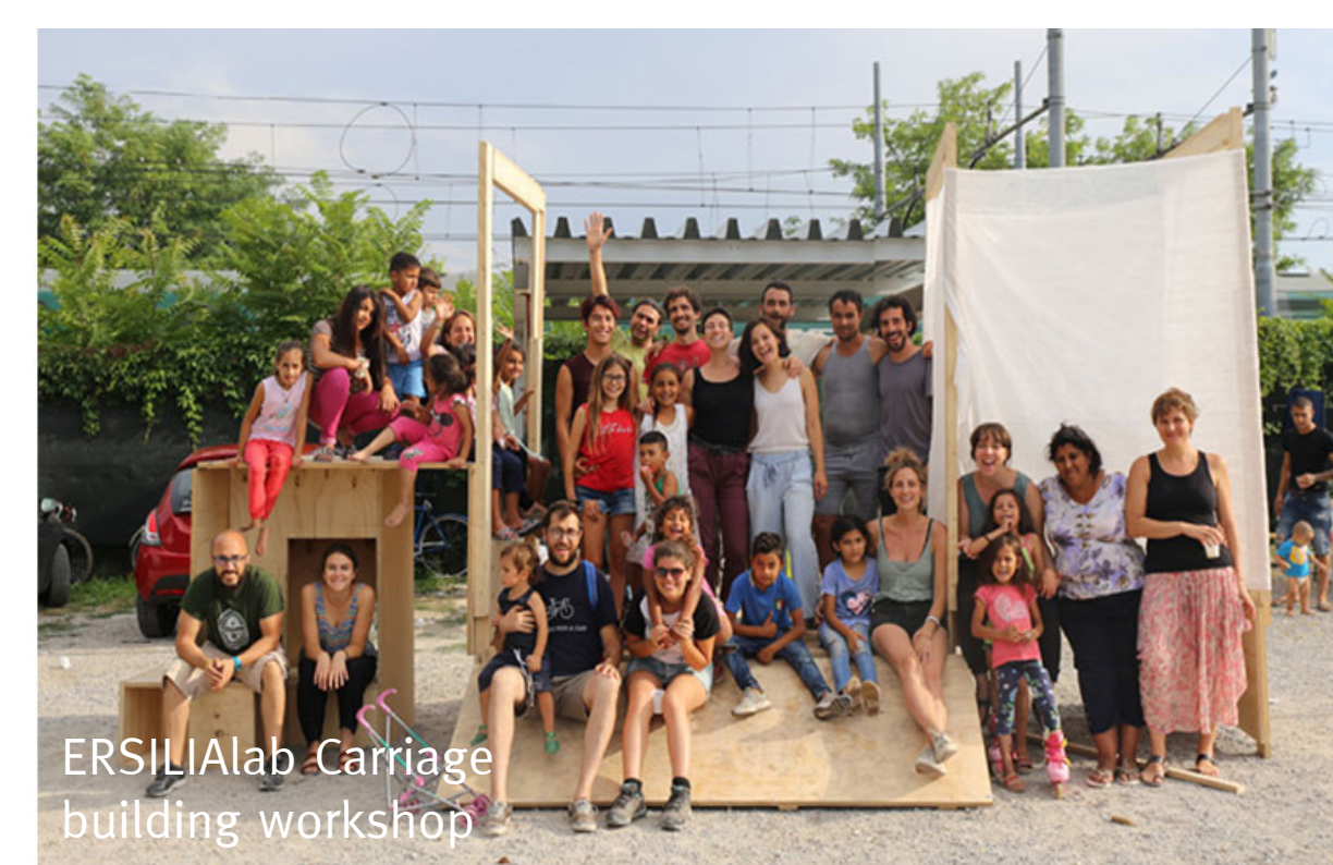
ERSILIAlab Carriage building workshop

The project went through different phases because of external obstacles —mainly political— that recurrently asked its remodulation. In its first version, the Relational Library gathered Roma and gadje 's aspirations around the participatory realisation of a temporary wooden library, located in one of the neighbourhood parks —parco Alessandrini—, placed halfway between Bonfadini camp, Sacile C.A.T., and the rest of the neighborhood. The construction would have been supported by local associations and working activities.