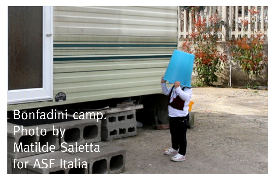
Bonfadini camp.

We conceive space not as an outcome in itself, but rather as a tool to produce fair and sustainable (self-)development.