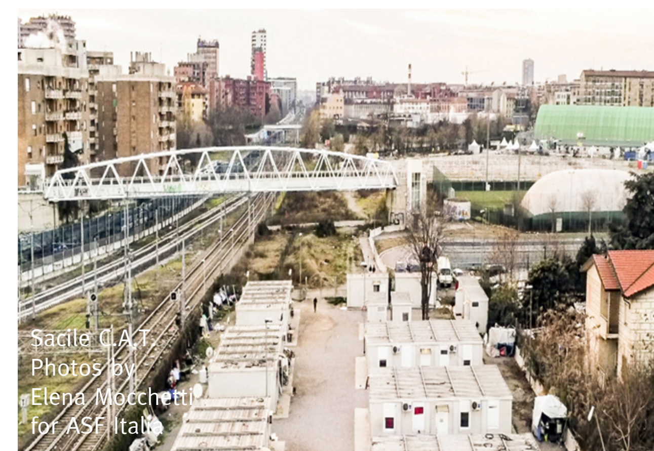
Sacile C.A.T.