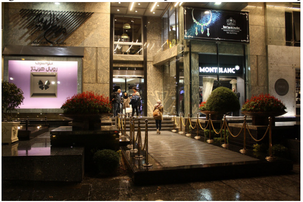
[Figure 2] Commercial-shopping towers in the north Tehran (Capital of Iran)

cause minimalism approach eliminates all the negative visual signs as showing off power and capitalism in some levels. Figures 2 and 3are some samples of commercial-shopping towers in the north Tehran (Capital of Iran) in which