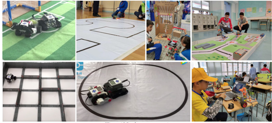
[Figure 3] Product usage scenario

Observing the usage scenario of DIY Robot Kit, we found that some additional props would be needed to assist the realization of product functions. For example, if a robot was to realize the function of path recognition, it would need a road map with black tracks on the ground for sensor to identify.