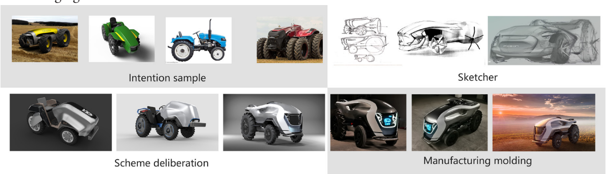
[Figure 3] Derivative diagram of tractor industrial design

To sum up, a new industrial design scheme of intelligent agricultural machinery has been developed, as shown in the following figure: