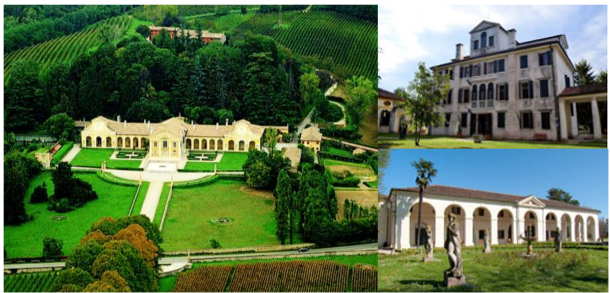
[Figure 1] Villa Venier Contarini in Mira (Venice, Italy)

Villa Venier Contarini in Mira (Figure 1) is part of the UNESCO site 'City of Vicenza and the Palladian Villas of the Veneto' (UNESCO WHC, 2016), which includes twenty-four villas designed by Andrea Palladio in XVI Century. The villa complex is composed by a set of buildings and open spaces oriented along a North-South axis. The owners were housed in the main building, while the work areas were located in the 'barchesse' (outhouses) on sides of the building; in front of the main building there is an entrance garden and, on the back, a park. Two floors compose the central body of the villa: at the first floor – also known as 'noble floor' – there is a large living room with a loggia used for parties, the ground floor was intended for building's services.